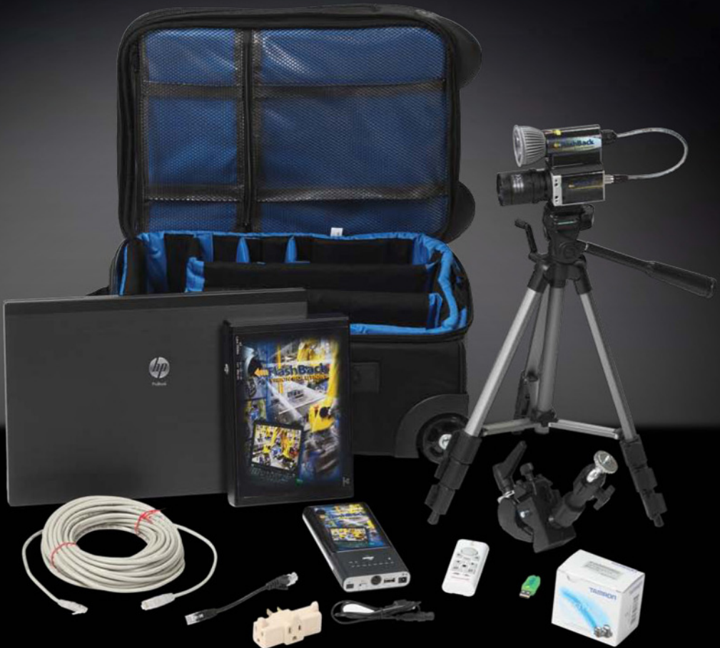
Standard DC Unit