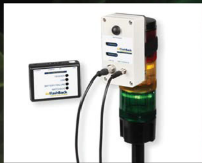
Triggers - OPC Server, Stack Light, Dry Contact, 24 volt