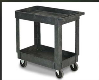
FlashBack Cart - convenient operations / storage cart

FlashBack Vision Solutions, LLC 135 Edinburgh Court Greenville, SC 29607