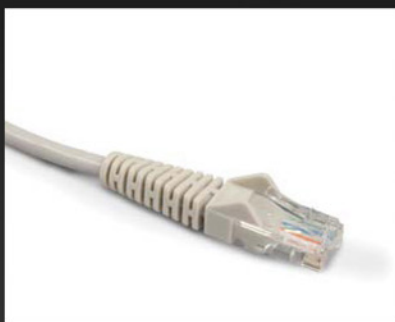
50ft & 100ft Camera Cables