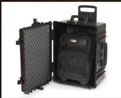
Hard Shell Storage / Shipping Case