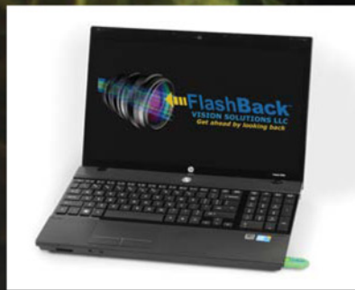
Laptop (can be upgraded to 500GB)