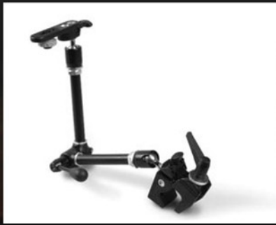
Articulating Magic Arm Camera Clamp