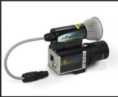
Cameras - 30, 60, & 150 frames per second