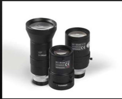
A Variety of Lens Choices