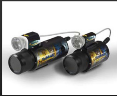
Water Tight / Dust Tight Camera Enclosures