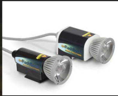
LED Extension Cables with Light Clamp